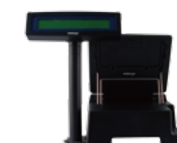
Based mounted customer pole display LCD PD-309 (2 x 20)