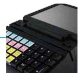
Built-in magnetic stripe reader (MSR)(Optional)