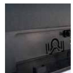
Front access push-open cover for power switch