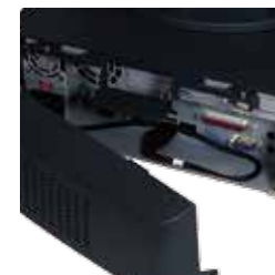
Rear cable cover for safety and neat outlook